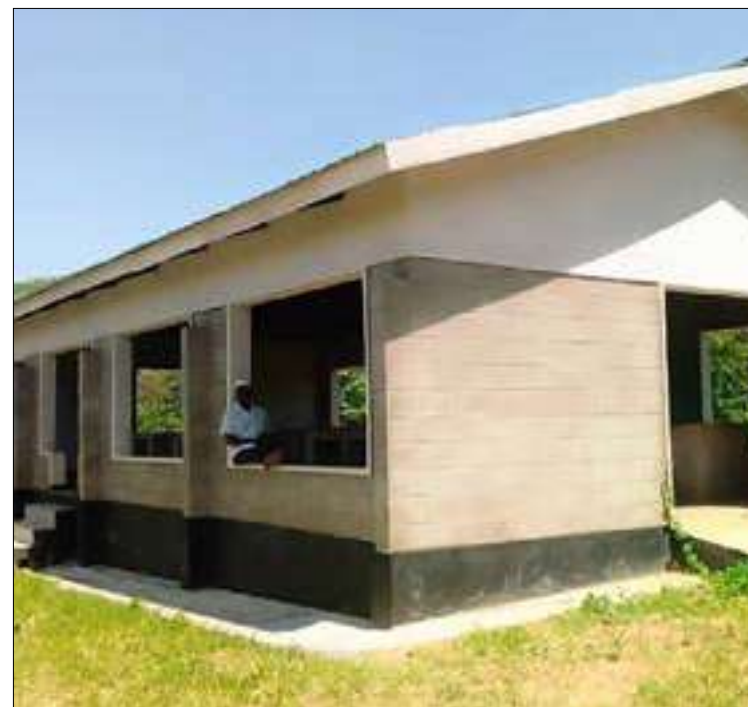
Lozi Market Shade structure

"We have finalized everything at the site and handed over the facility to the vendors for the operations to commence. We