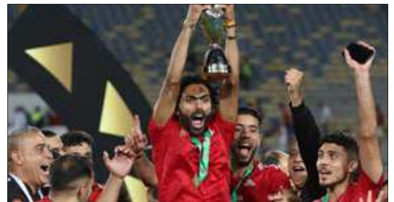
Al Ahly won the CAF Champions League previously