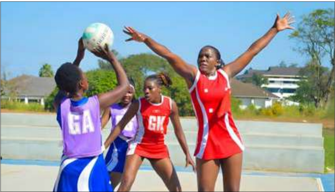
Kukoma Diamonds in their previous game

"We are going into the third week but I can proudly tell the nation that as organisers of the League we are impressed