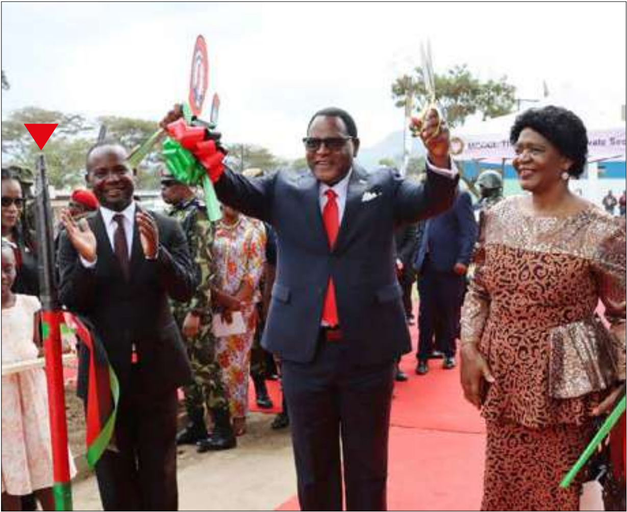
Chakwera Kicks Off 34th Trade Fair

Recently, President Dr. Lazarus Chakwera affirmed his government's commitment in creating a conducive environment for the private sector to increase their production and enhance the