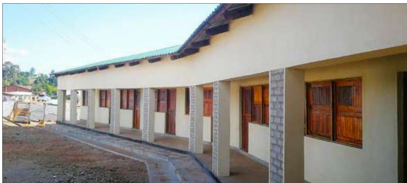
One of the areas where debris slows electricity generation

Unyolo added that currently people are selling their merchandise along the road exposing both vendors and customer to accidents that can