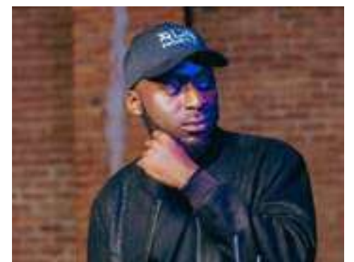
Mudolo - The festival will celebrate beauty of nature in winter season

This year, the Winter Bush Festival is being sponsored by The Diamond Standard, Adventures with Colby, Newwave, Run North and Mikozi and will be held under the theme 'Connecting people through nature'.