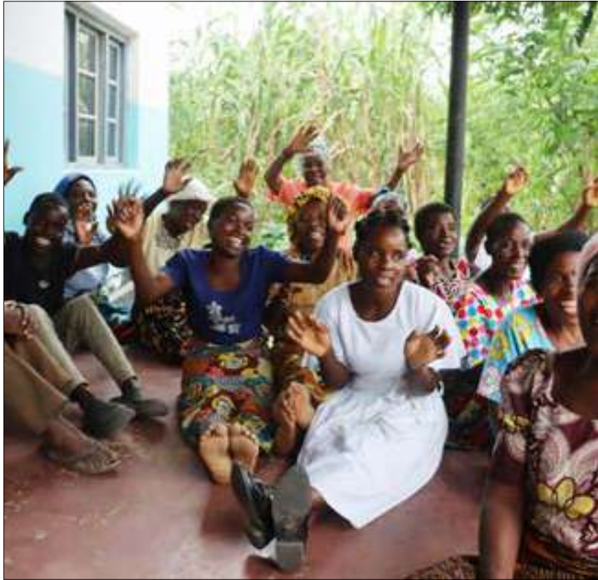
Happy with CRI - some of the members of Nthambi Club

successfully created in 2023 with funds from the International Fund for Agriculture Development (IFAD).