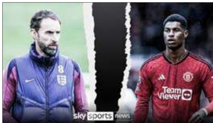
Henderson(L) & Rashford (R)

Henderson joined Al-Ettifaq in Saudi Arabia from Liverpool last summer but left them to join a