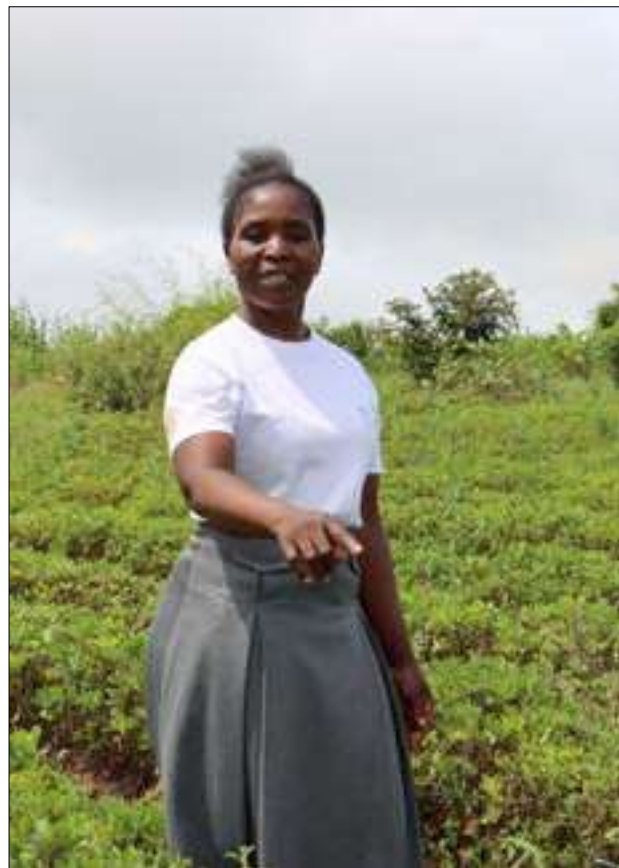
Sitolo (AEDO) CRI has done wonders to the rural farmers' lives