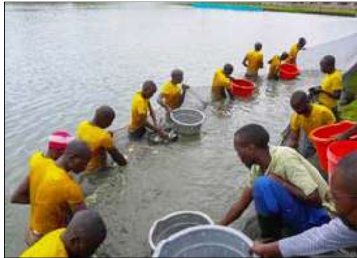
People harvesting fish at one of Mzuzu Aquaculture Centre's fish ponds

"As fishermen, we comply with the directive not to fish during breeding season. When it comes to fish farming in ponds, most fishermen here in Likoma have no