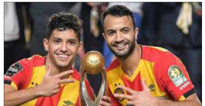
Esperance Sportive de Tunis wins CAF Champions League

The success of Al Ahly and Esperance underscores the importance of local development and institutional support in African football. Their models offer valuable lessons for other clubs striving for continental prominence.