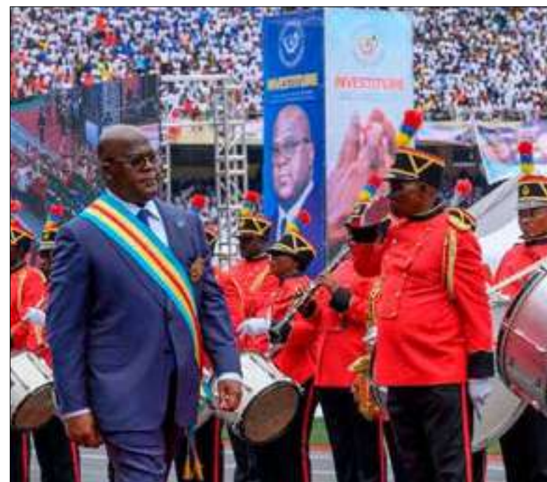
DRC President Felix Tshisekedi

They show an armed man in military uniform with a Zaire crest and flag shouting: "Félix, get out, we soldiers are tired of suffering. Today, we wake up with a new country. We can no