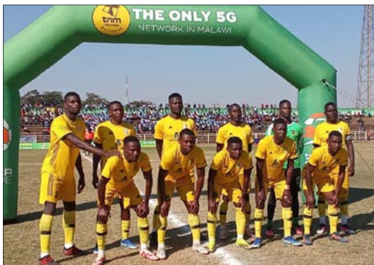
Kamuzu Barracks stood firm against Silver

It tough going for the reigning champions as they are still failing to put their acts together and have recorded their eighth defeat of the