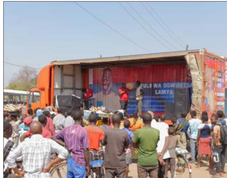
Consumers being entertained while learning.

"As a regulator, it is our role to legally register every courier company that wants to be conducting courier businesses. This is the case because we want to protect consumers and their goods since entertaining such