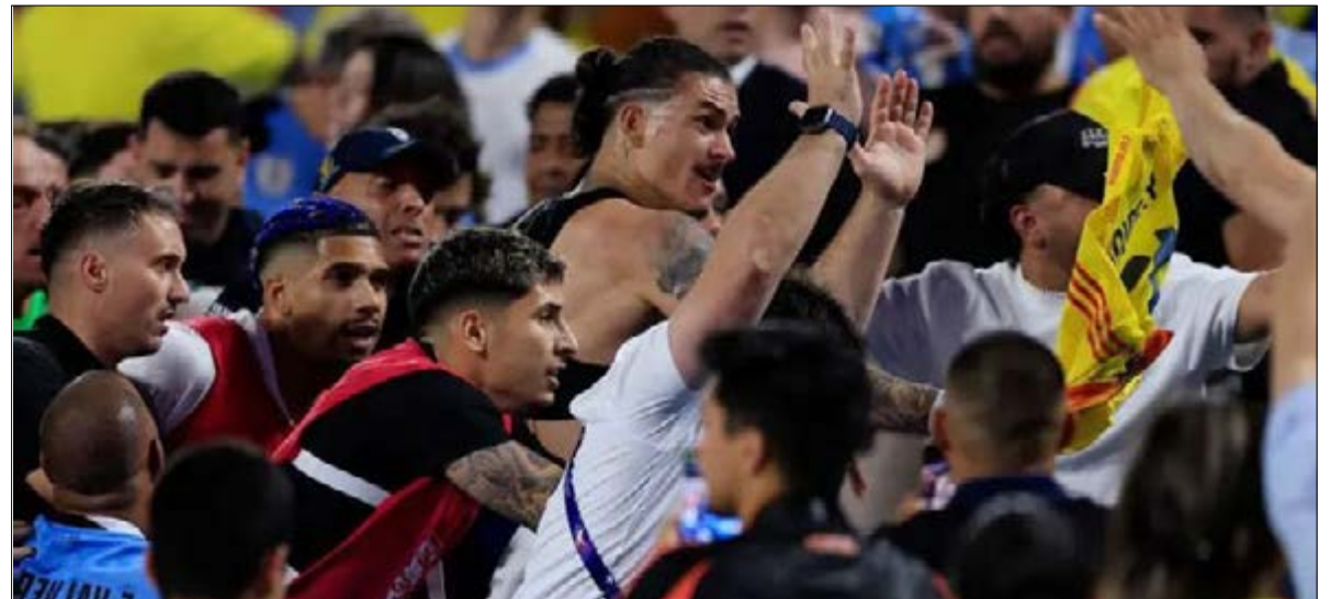
Núñez seen climbing the railings going into the crowd

LIVERPOOL footballer Darwin Núñez was involved in an altercation with spectators after his national team Uruguay were beaten on Wednesday evening.