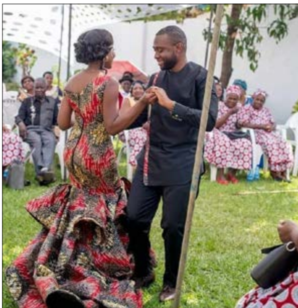
Bride and Groom chitenje outfits

adorned in traditional tailored suits made from a plain fabric but patches of their shirts are made from chitenje fabric. It's a harmonious blend of formality and cultural pride.