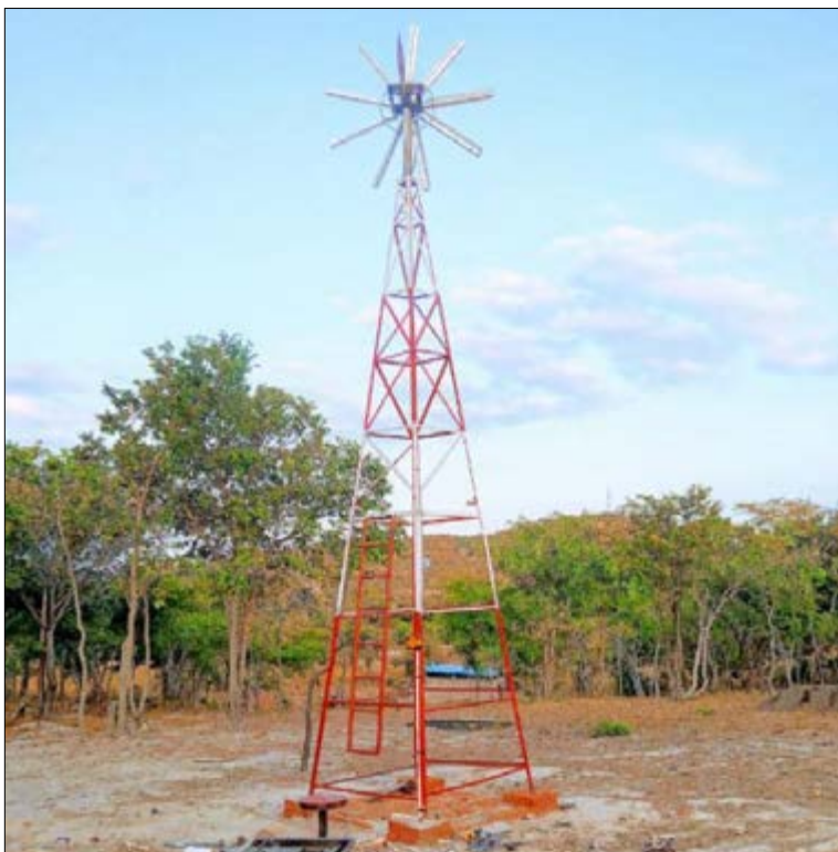
The electric windmill