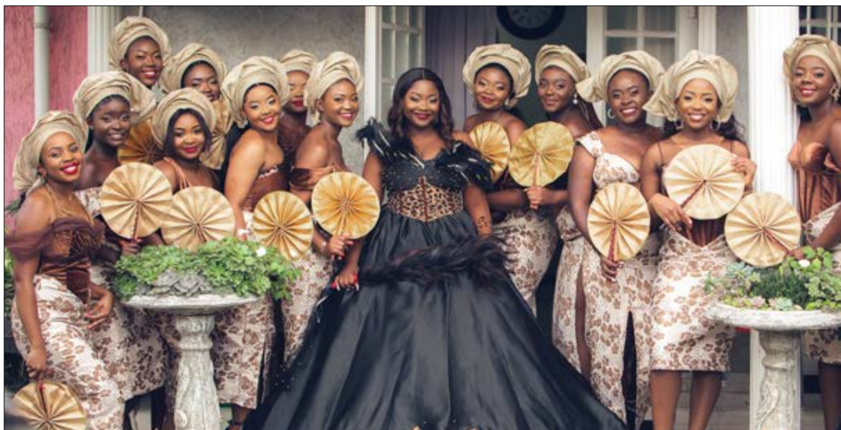
Bride and her dancing Queens