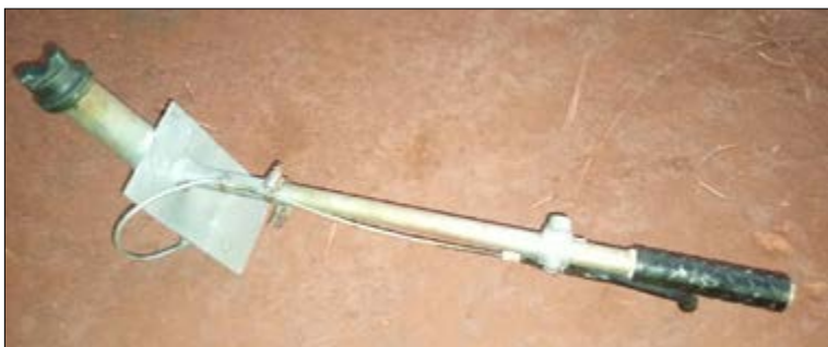
The new planting hoe