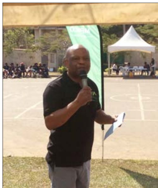
Katopola- We call for private sector support in sports development