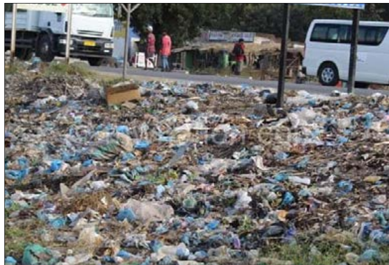
Plastic bags creating unhealthy environment for Malawians

The forum has brought together foreign dignitaries from 11 countries, representatives from the public and private sectors, and the academia among others.