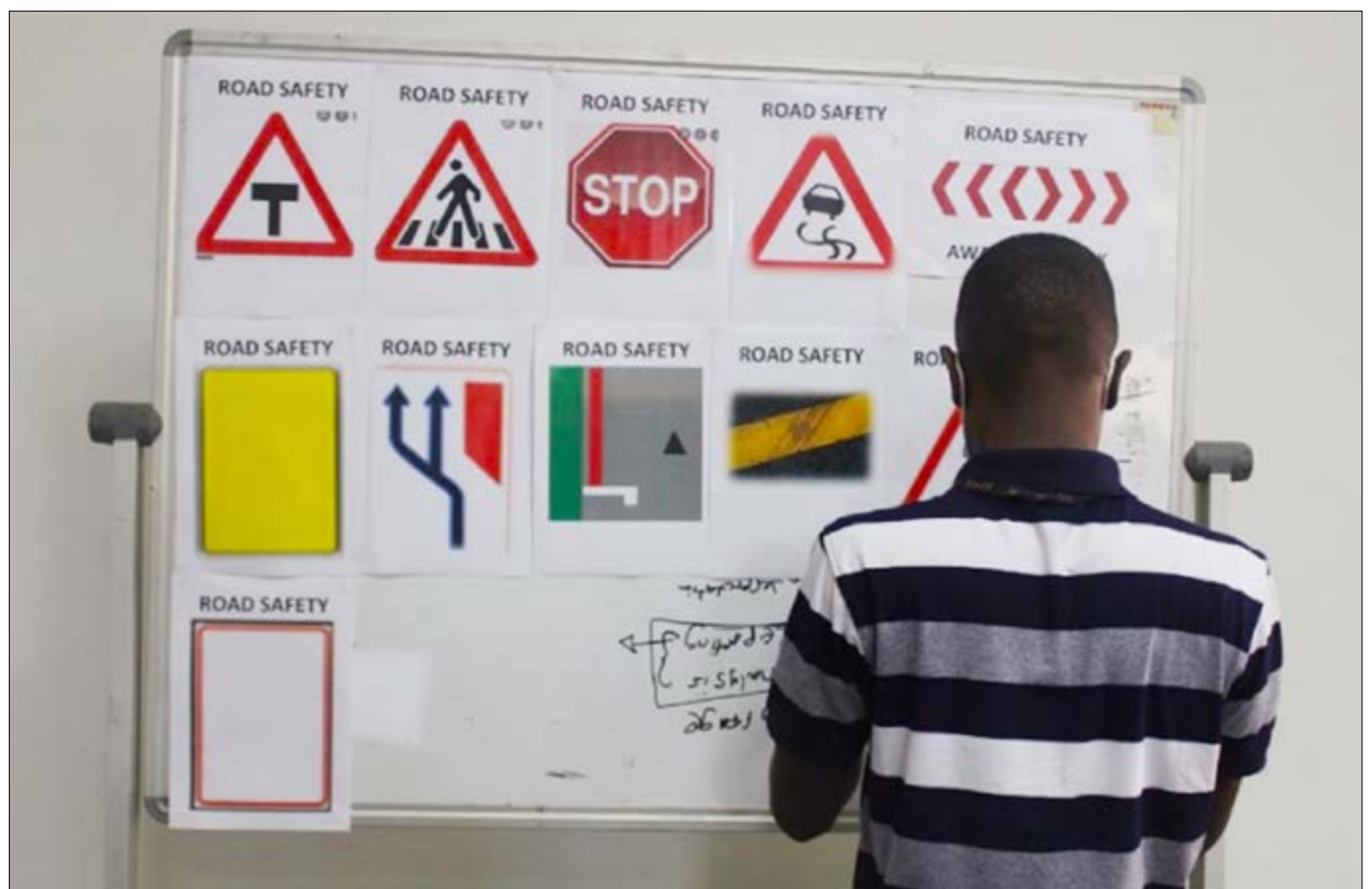
Take heed of road traffic signs and regulations