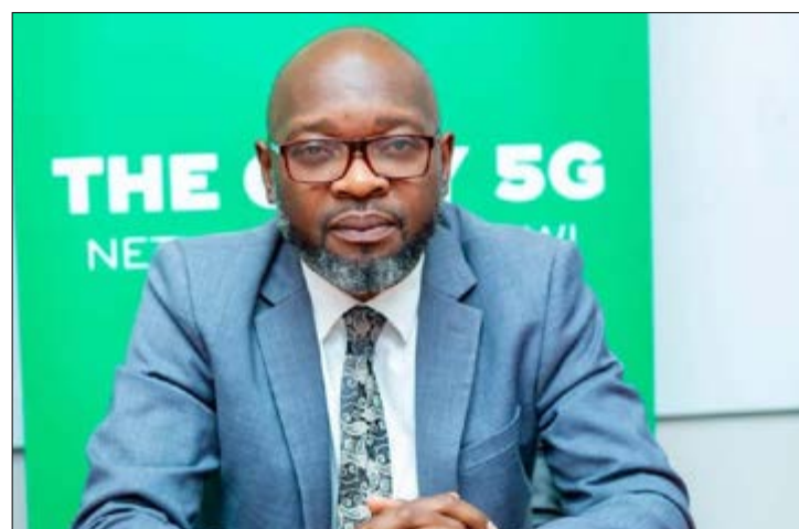
Nsapato- The bundle is affordable

"This bundle will only be accessed by civil servants recognized by the Malawi government, we have engaged the civil servants' data base which we will be using for their registration and enrollment for them to be able to buy the bundles," he said.