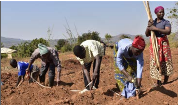
Community members taking part on Climate smart

"Check dams and swales have enhanced the availability of irrigation water and helped in the slow running of water that prevents our crops from floods, as such we are happy with the programme since we are now able to feed our families, buy clothes, buy farm inputs and as